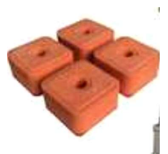
Figure 1.0 (b): MN blocks