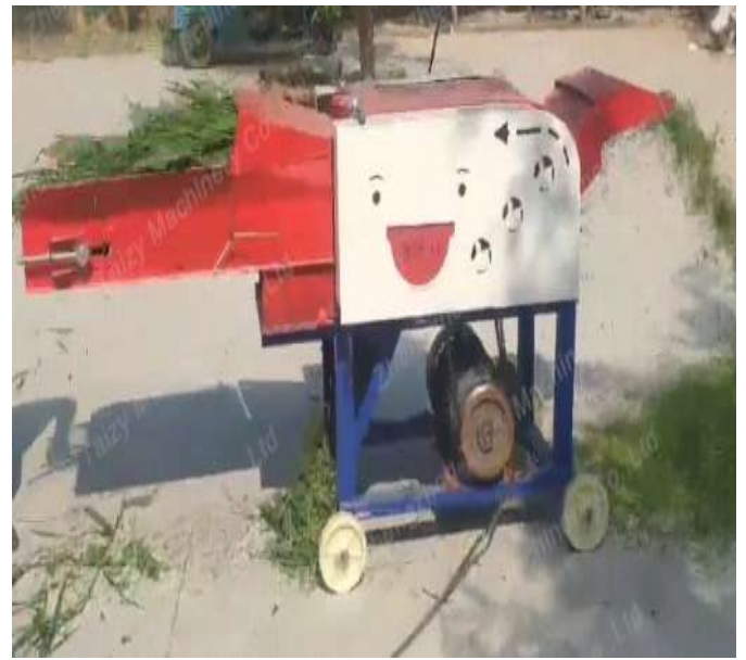
Figure 1.0(a): MNB Molding Machine

When selecting the method to be used in constructing the machine parts, many factors were considered. These includes; the basic size and shape of the machine, its required strength, dimensional tolerance and the materials from which it is to be made, as well as the economics of quality and cost as well as the manufacturing operations involved (welding, machining, followed by the finishing) Figure 1.0 (a) and the multinutrient (MN) blocks produced Figure 1.0 (b)